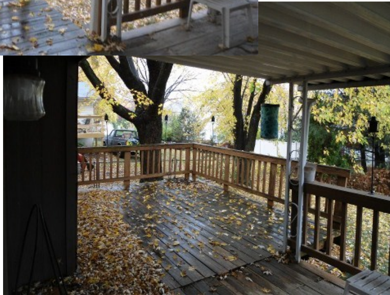
From Family Room